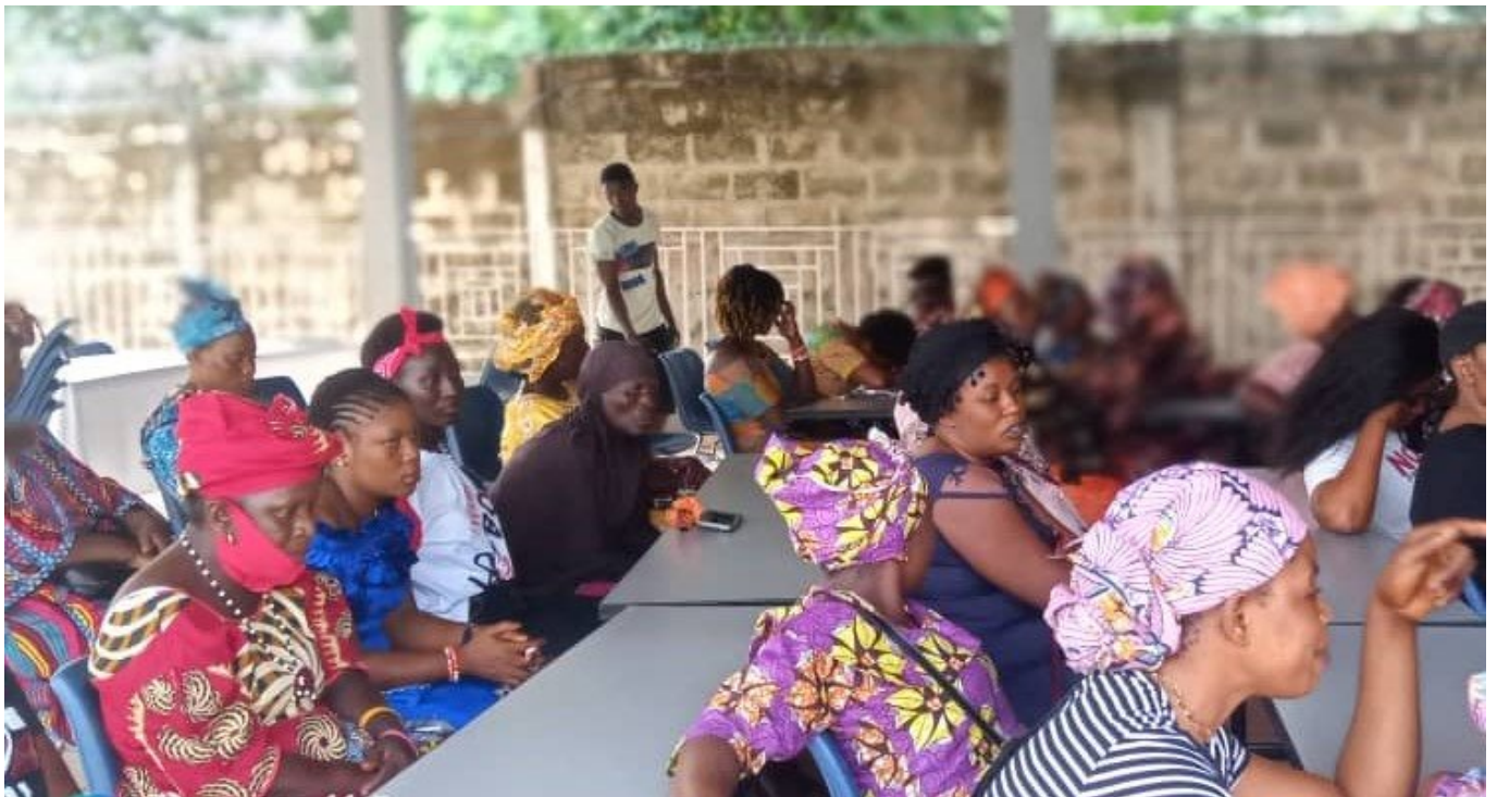
A group of women in Sierra Leone interviewed during the research process.

This piece was first published on the blog of the United Nations Capital Development Fund (UNCDF) here .