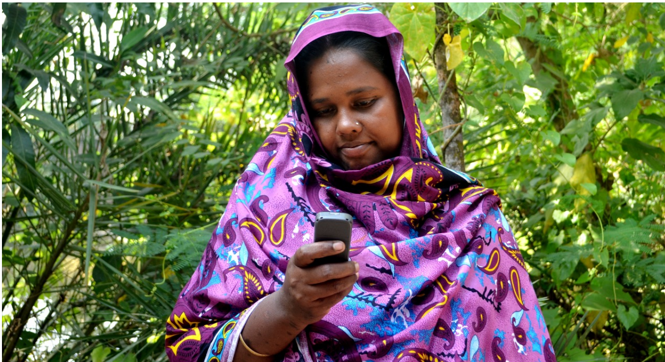
Woman farmer receiving mobile money on her phone, at USAID mSTAR workshop.