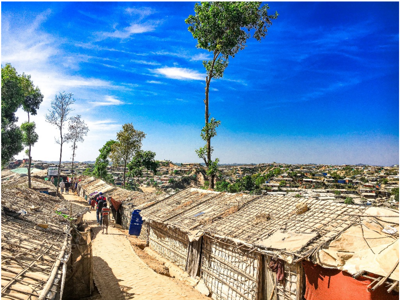
A photo of Kutupalong Refugee Camp in Ukhiya, Cox's Bazar, Bangladesh.

In advance of the last Global Refugee Forum in 2019, IPA drew attention to how limited the evidence base was on what works to improve outcomes for displaced populations and host communities. The good news is that this is changing. Since 2019, the number of rigorous impact evaluations with displacement-affected communities has more than doubled . IPA recently released a scoping review of these evaluations , summarizing what we know about what works to improve outcomes for displaced populations.