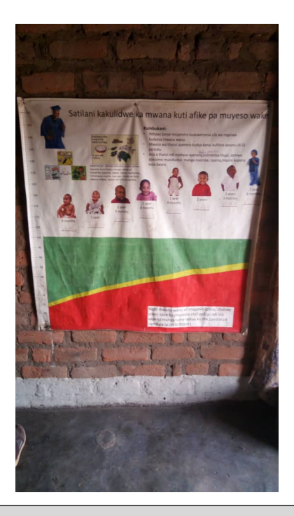
Figure 3-1: Growth chart from original study hanging in a house

This section presents the views and perceptions that the participants had over the use of the poster and the perceived benefits of the poster. Overall, most of the participants showed a good understanding of what the poster was about and its content. They were also able to demonstrate how the poster was used. Below we present specific views and perceptions relating to the growth charts that were distributed in the study areas.