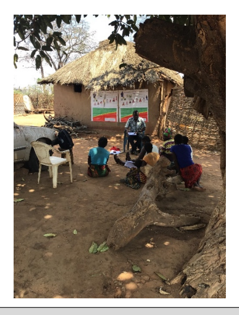
Figure 2-2: All Women Focus Group Discussion