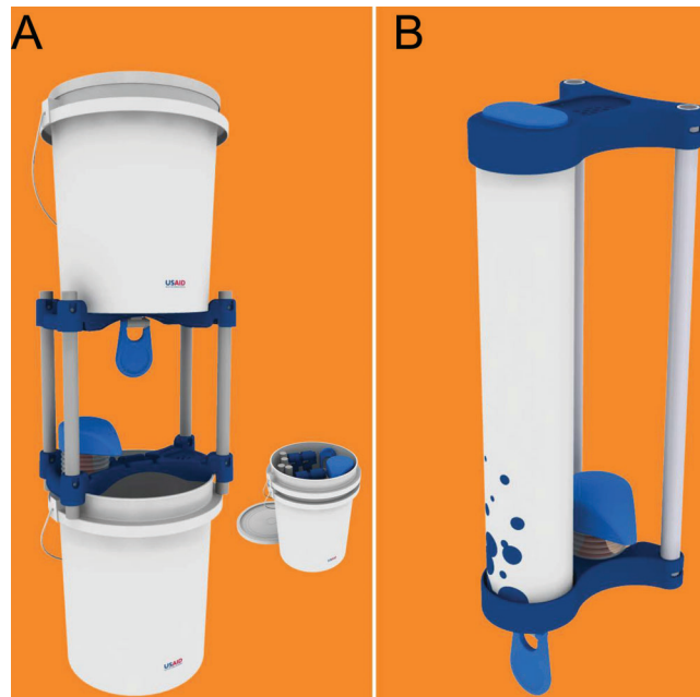
(A) bucket model design; (B) pipe model design.

The Povu Poa system uses 30%–77% less water than conventional handwashing stations used in Kenya.